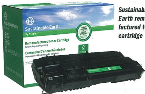
Sustainable Earth remanufactured toner cartridge

Kruger has released a new embossing pattern for its roll and multi-fold towel brands, which includes Embassy Supreme, Embassy, White Swan and Esteem labels. The pattern features a cross-wave design that Kruger said helps enhance the paper's look while increasing its absorption and strength. The product comes in packages of six, 12 or 24 towels, while the Forest Stewardship Council (FSC) and/or EcoLogo provide certification. The towels are suitable across various industries such as